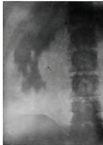
Figure 2: Fenwick's illustration of 'rule 14' showing a large branched and rayed phosphatic stone, i.e. a staghorn calculus.